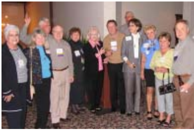
Orland Park Rotarians attend the District Conference

Medical school - I plan to be a pediatrician. Hobbies: Soccer, hanging out with friends, reading Favorite American Memories: Meeting all the other exchange students, trip to Washington, D.C., going to the Oprah Winfrey show, Hardest Part of Being an on an Exchange: Being away from your family and friends Overall Experience: It's great to really be able to experience another culture which you aren't able to if you're traveling by yourself, learning another language. I have had a great experience and will never forget my year here in the states.